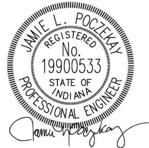
Jamie L. Poczekay, PE Civil (Water/Sanitary Sewer)